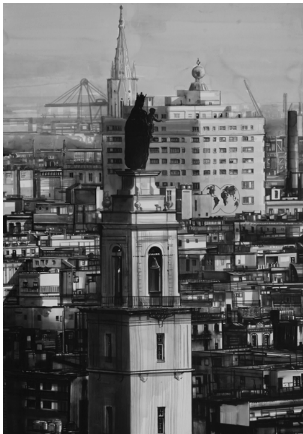
La Habana From the series Anthropocene

watercolor mounted on wooden panel 200 x 140 cm 2023