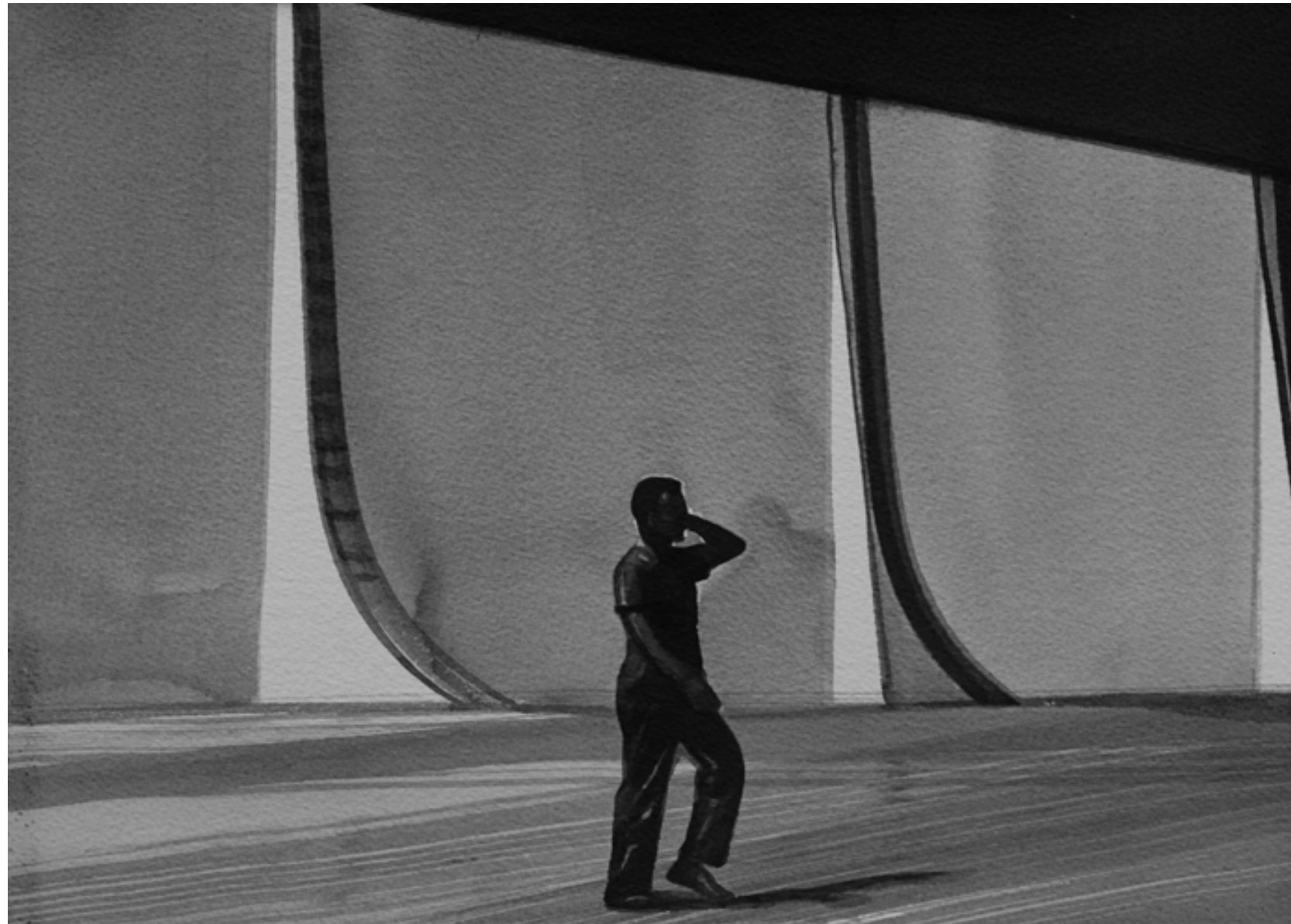
Brazilia From the series Broken Time