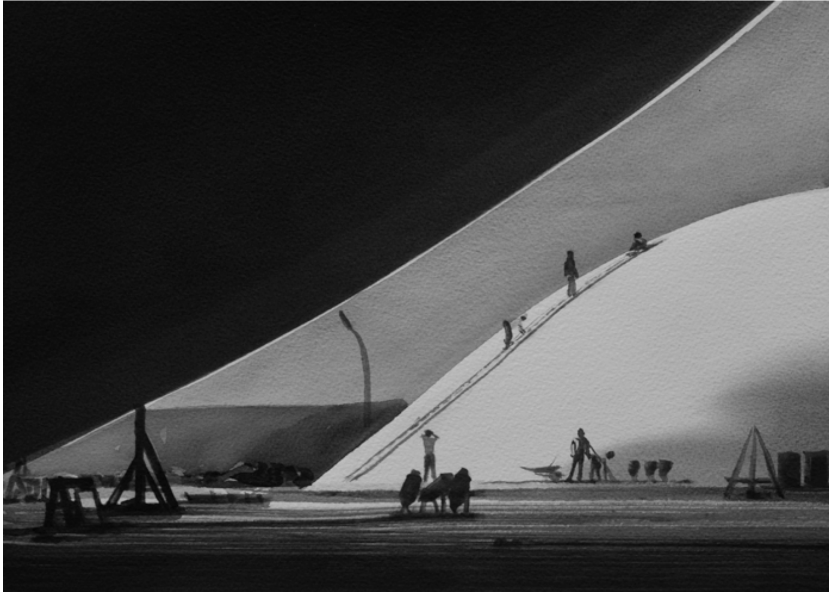
Brazilia From the series Broken Time