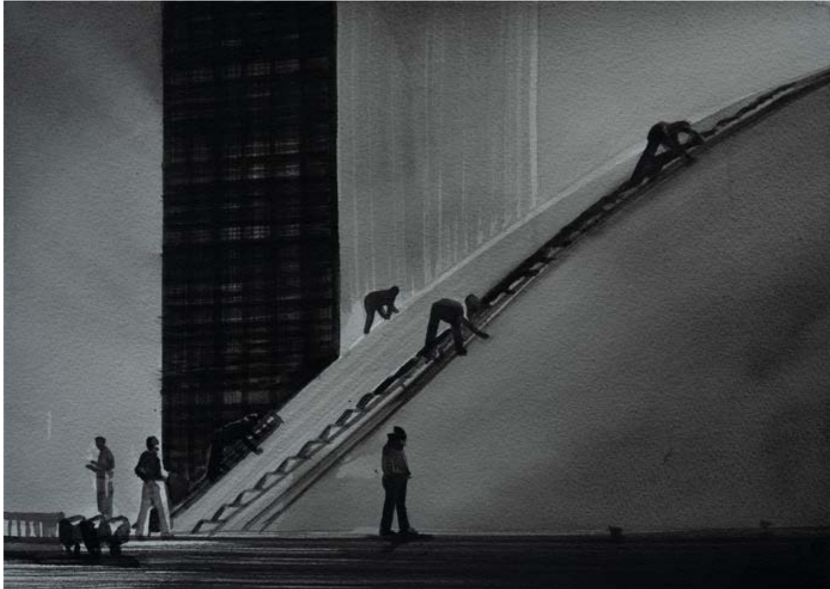
Brazilia From the series Broken Time