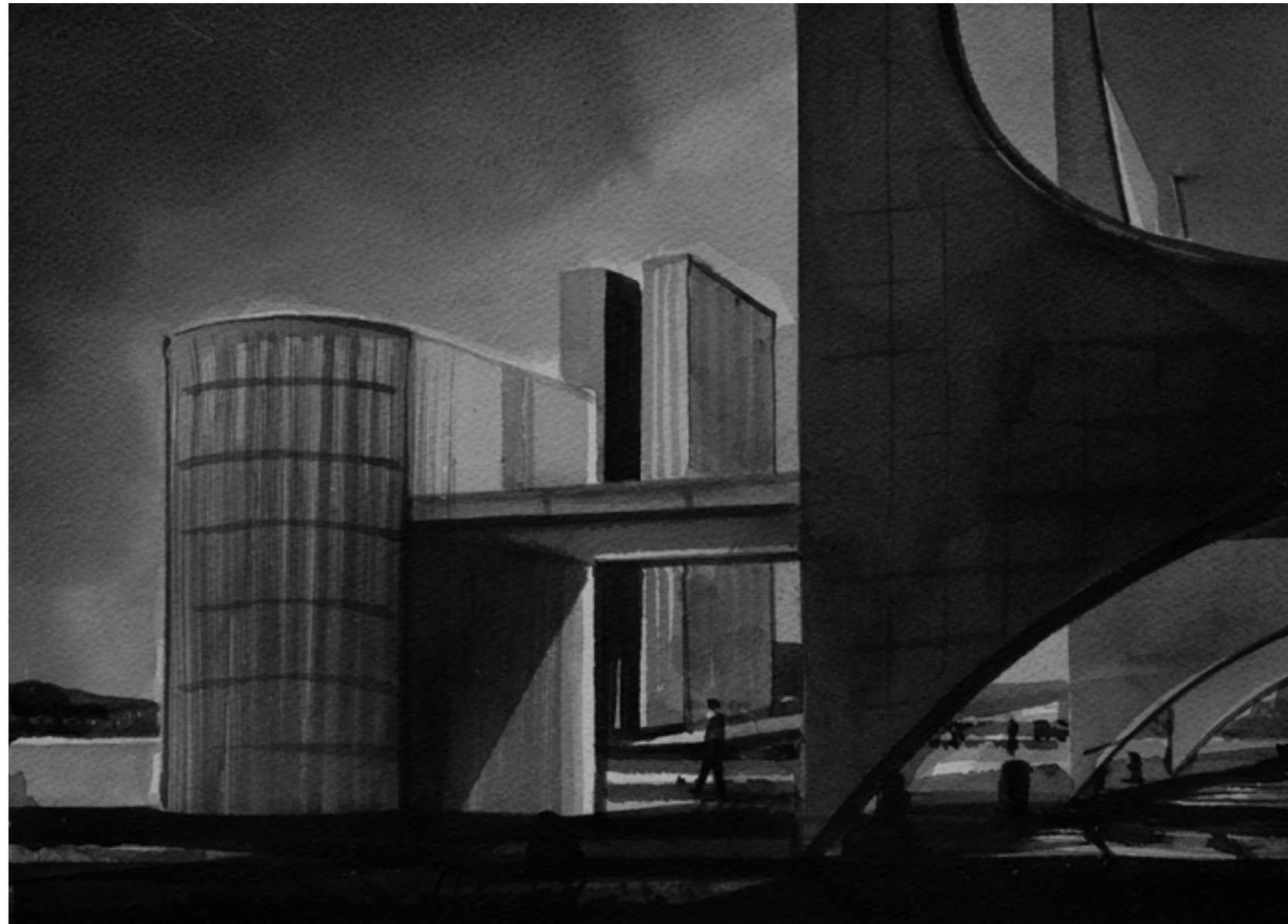
Brazilia From the series Broken Time