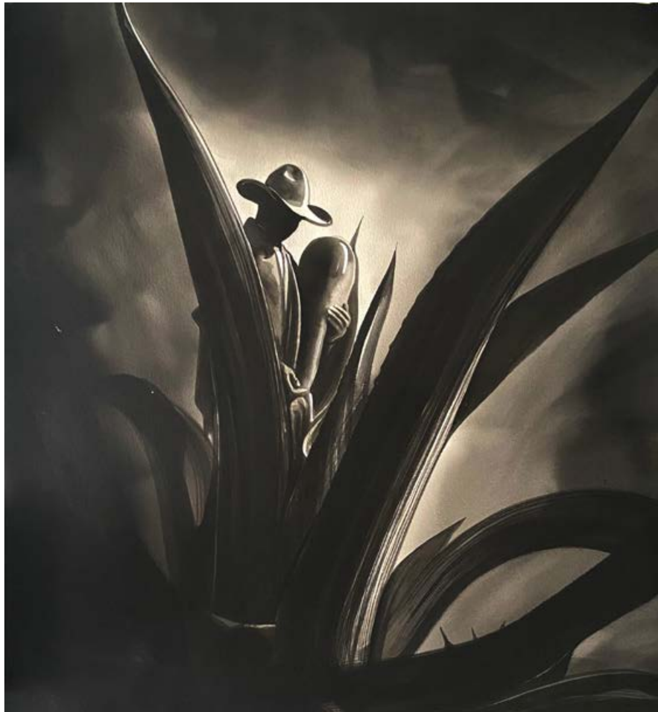
Points of inflection