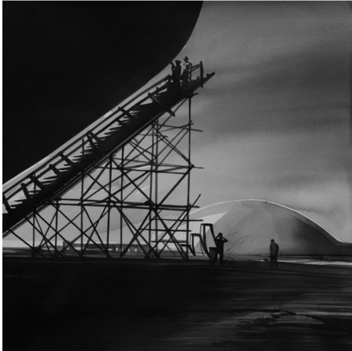
Brazilia From the series Broken Time