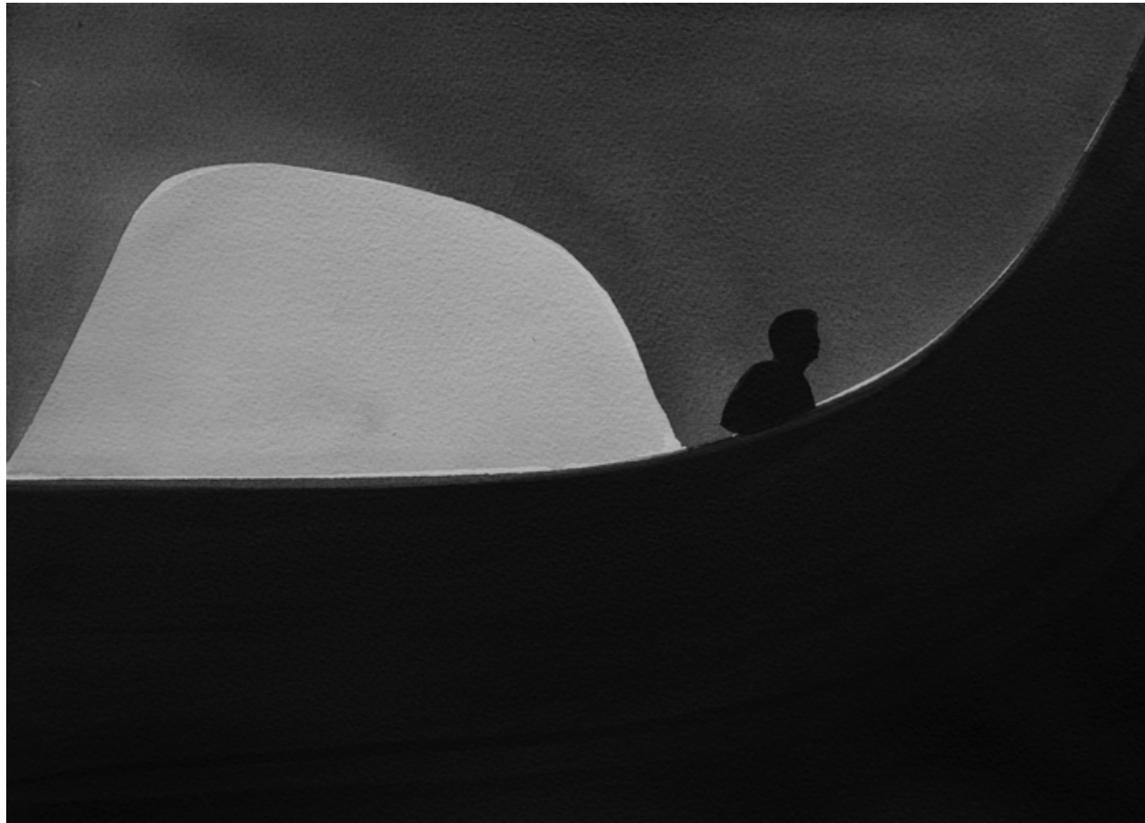
Brazilia From the series Broken Time