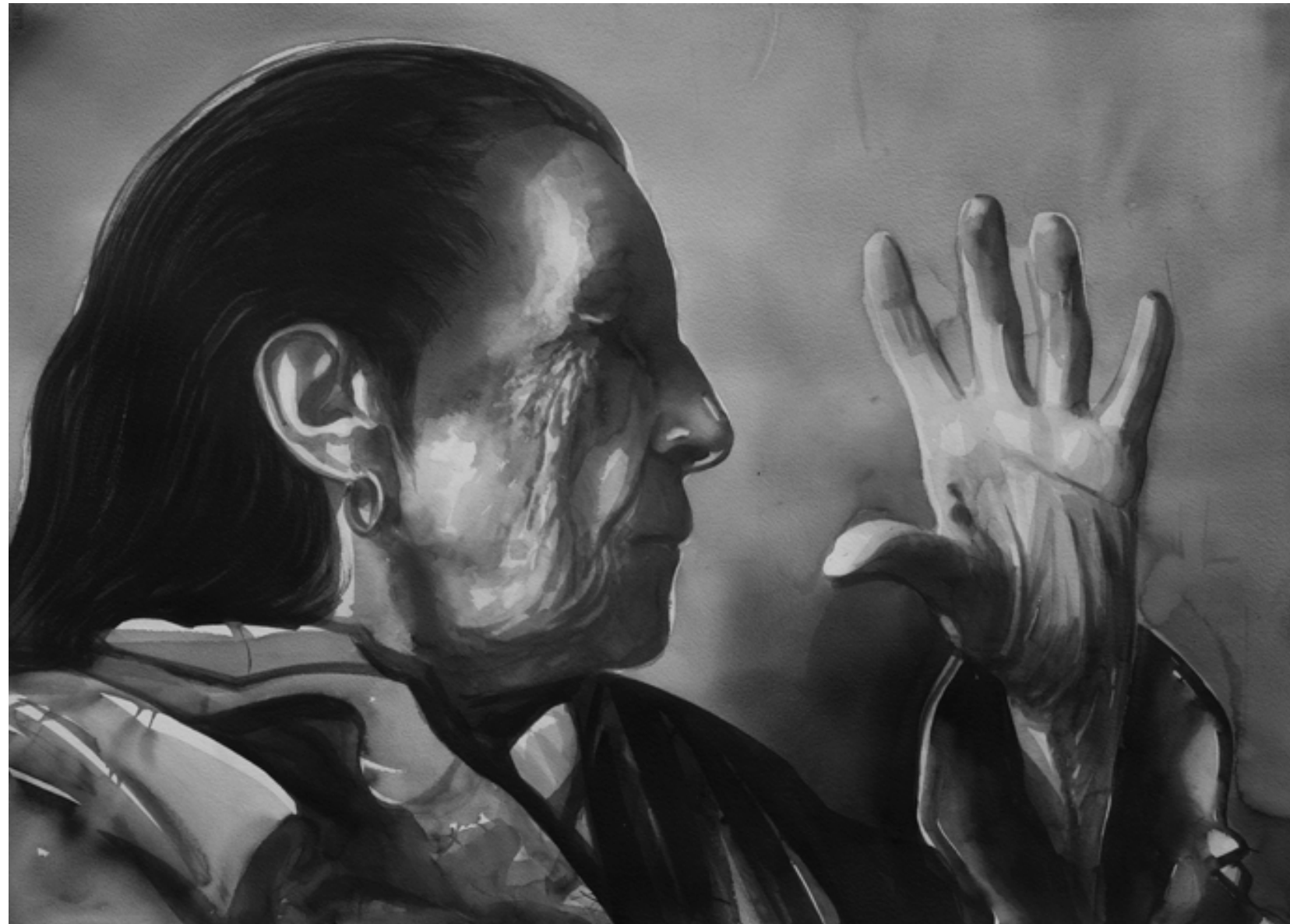
Louise Bourgeois From the series HER(O)S

Watercolor on archer paper 50 x 70 cm 2022