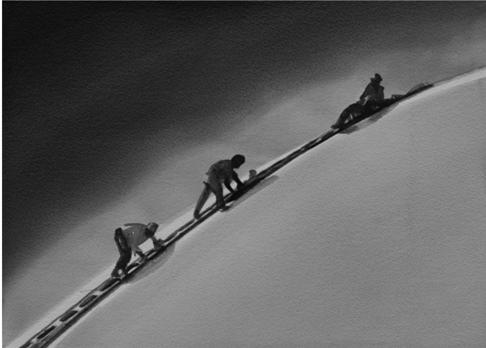
Brazilia From the series Broken Time