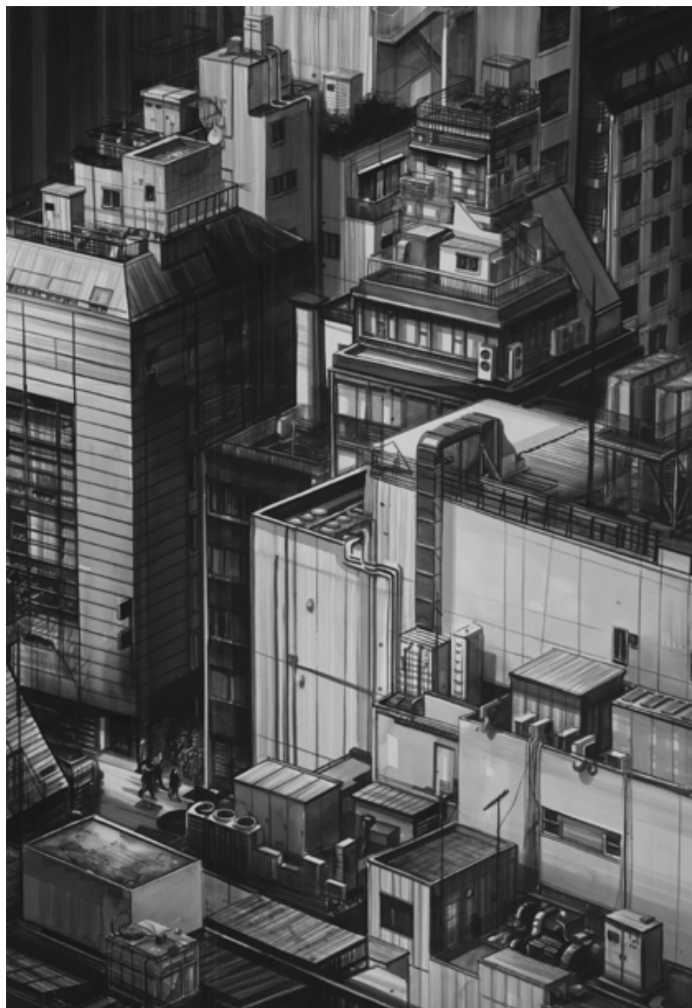
Tokyo From the series Anthropocene

watercolor mounted on wooden panel 200 x 140 cm 2023