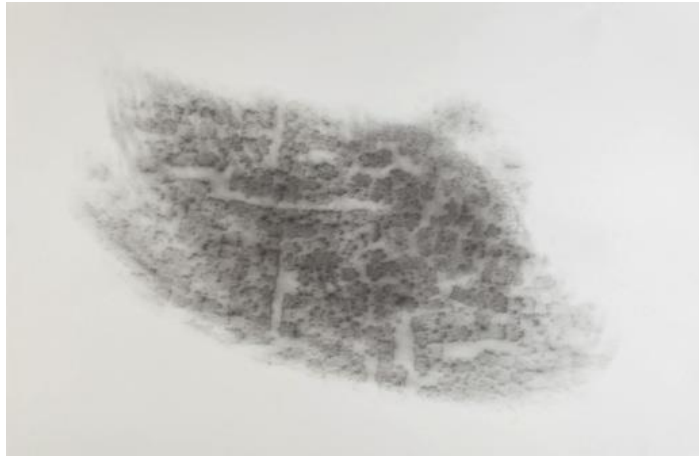
Frottage 001, 2015, grafito sobre papel, 96.5 x 64 cm

Second, this project leads us towards a work of research in art. It evidences an investigative process that lacks a priori starting points. Research is assumed as an act performed in the manipulation of materials, in conducting experiments, in the exercise of "trial and error" both conceptually and formally. In this sense, this exhibition constitutes what Simon Sheikh refers to as a show/investigation, where the exhibition is not only a vehicle for the display of results but is also presented as a process in a state of flux, where new proposals appear and are updated in relation to the formats and thematic interests of the exhibition.