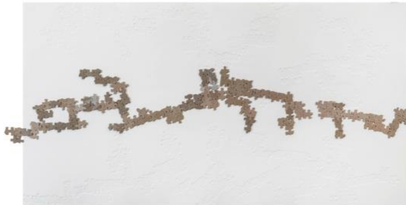
Intaglio con collage 003, 2015, Intaglio sobre papel de algodón con fichas de rompecabezas de cartón, 93.5 x 47 cm

Taking the puzzle as his point of departure, Villegas approaches an investigation into the formal possibilities that derive from the action of assembling pieces that do not fit, disregarding the images conventionally used as the guidelines to construction. Working on the background plane, the pieces of the puzzle insinuate fractals that, subject to the force of the hammer, are assembled in blocks that form diverse spatial clusters. This exercise explores various constructive possibilities based on the generation of nexuses between background and figure. In this process, the jigsaw piece is established as a universal sign and fundamental driver in a process of configuration.